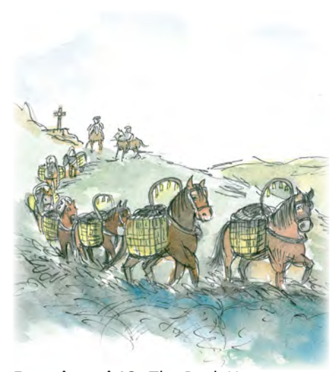
From board 12: The Pack Horse Bridge formed part of the transport network, providing a link between the Drovers' Road and the larger towns to the west of Thirsk and Sowerby.

Cross the road at Blakey Bridge, go through the kissing gate and along the path for about 50m to board 11 facing Pudding Pie Hill. This is an ancient burial mound, at least 2,500 years old, which is clearly visible from the bridge.